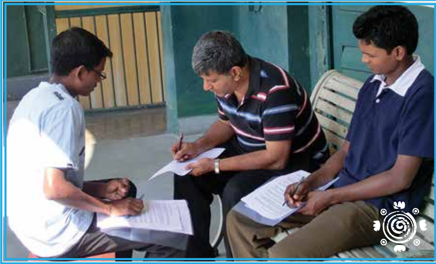
Brothers reviewing the proposition “A Way into the Future” in Kolkata, India