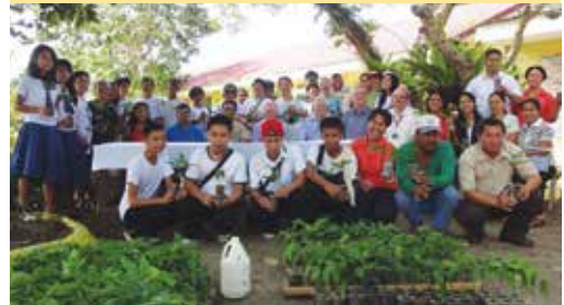
Edmund Rice Services, Maasin, Philippines.

A ustralian and Indian Brothers moved in 2010 to Maasin in southern Leyte, Philippines, as it is an area with many social needs. They spent time there listening to over seventy local groups and individuals to hear about the needs first-hand. The community then chose three strands to work on: animating pastoral work in needy high schools, supporting Back-to Schooling programmes and setting up a programme for young people with disabilities. Each strand has a team comprised of a Brother and a group of young people. The three teams operate and collaborate under the umbrella of Edmund Rice Services which provides administrative support. Thousands of young people have already benefitted from the work.