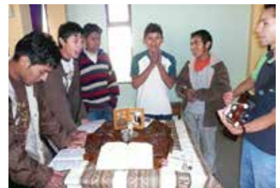
Vocation Day, Lima, Peru.

In order to work and live in a sustainable way in these marginal areas, our experience has shown us the need for a healthy, balanced lifestyle. Healthy celibate living, especially in remote places, is only possible if we integrate certain disciplines and practices into our lives.