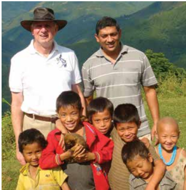
Brothers with local children in Sangram, India.