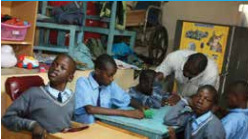
Mary Rice Centre, Nairobi, Kenya.

I n 2010 two Kenyan Christian Brothers, working in Nairobi, conducted a survey within Kibera slum. They discovered that children with disabilities were the most excluded within their society. They opened the Mary Rice Centre to offer support to these children and their families. Today, teachers deliver a special curriculum and specialists in occupational and physical therapy work with the children. The staff also works with the parents and the local community to challenge the stigma that keeps these children excluded from their society. The Centre is developing new activities each year and deeply appreciated by the families and community.