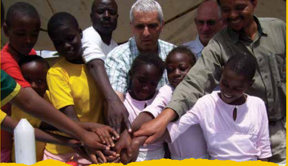
Brothers, staff and students celebrate Edmund Rice's 250th birthday, Nairobi, Kenya.