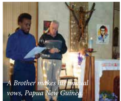
A Brother makes his annual vows, Papua New Guinea.