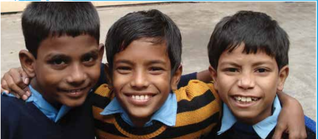
Students at St. George's School, Kolkata, India.

In the chosen marginalised areas, we will collaborate with other groups, in addressing the causes of unjust living situations. These issues will then be brought to the attention of global forums through the Edmund Rice International team, which works alongside other faith-based NGOs at the United Nations in Geneva and New York. This new focus on people in poverty is our contribution to the achievement of the U.N. Millennium Development Goals. The Brothers bring their skills as educators and pastoral workers, in new partnerships with others, particularly in the fields of primary education, HIV/Aids reduction and environmental awareness-raising.